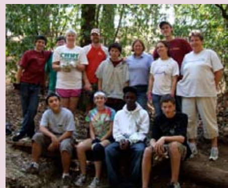
The God Squad group from the Contra Costa Deanery; one of the many groups that make up the fabric of the Ranch.