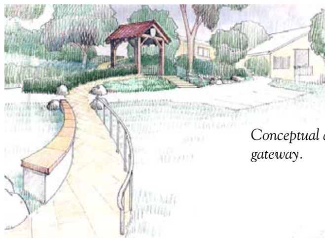
Conceptual drawing of new gateway.

Delivery trucks will have a temporary parking area to enable goods to be wheeled up the gradual ramp. This will allow the top of the hill where pedestrians walk and children play to remain free of large, noisy vehicles. Garbage pick up will be able to occur further away, reducing the necessity of a great noisy truck driving near the Chapel and other buildings in the