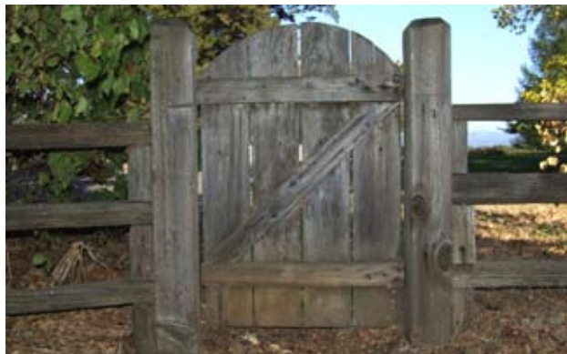
Where is your gateway?