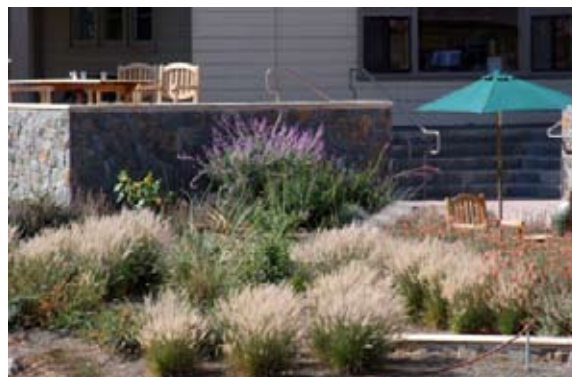
Landscaping on the southwest side of the Pavilion.

With this opportunity, your gift to the Swing Pavilion landscaping fund will be matched dollar for dollar. Consider making your dollars count twice and make a contribution to the Swing Pavilion landscaping fund today.