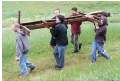
Young men from De la Salle High School carry the cross up the trail to the installation site.