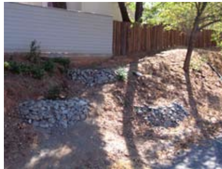
The current favorite billy goat trail and the area where the new ramp will go.

pedestrian entryway from the parking area through this bank to the main area of the campus. The entryway will be constructed to have a gradual slope, making it easily handicapped accessible. Over time the ramp will become